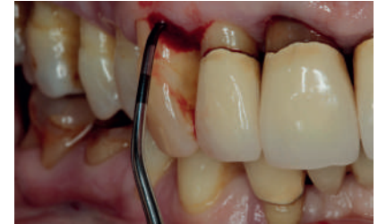
DS1CN on the anterior area.