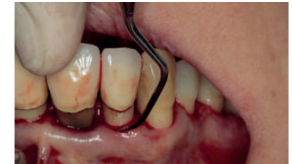
DS1CN on the buccal surface.

"We have found these instruments to be very ergonomic and easy to use. The design of the curette allows you to change the surface you are treating without changing instruments, thus reducing the number of instruments you have on your tray. The sharpness, hardness and flexibility of the tips are amazing. They feel like new instruments every time!"